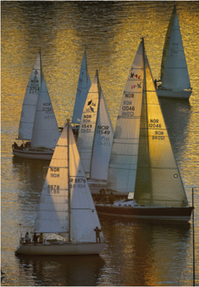
Sports&Lifestyle January 2026